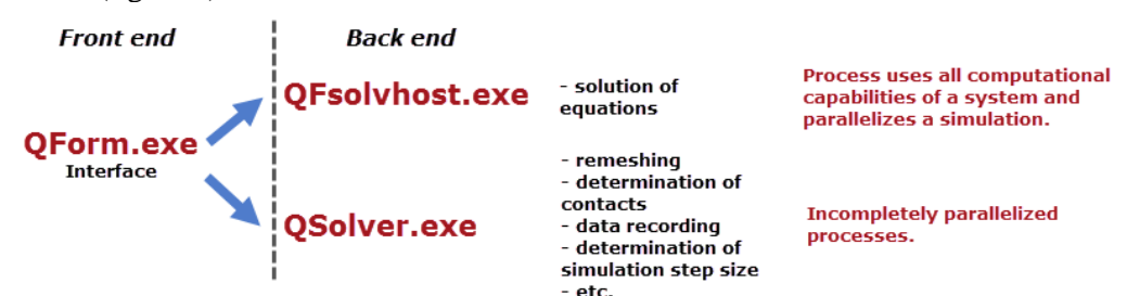
Fig. 1. Parallelized and incompletely parallelized processes in QForm software

Two processes are launched after the start of a simulation in QForm software: QSolver.exe and QFsolvhost.exe (figure 1).